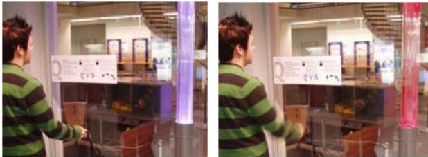
Figure 1. Oulu Expo demonstration.

multimedia presentation and a tabletop could be controlled by gestures. The demonstration was presented at Heureka Science Center in Finland for a one year, 2004-2005. This demonstration is on display now in the Knowledge Pavilion - Centre of Live Science in Lisbon. The second demonstration was developed for Oulu Expo in 2004-2005. The Oulu Expo demonstration was quite similar to “Aurora Borealis” presented in this paper. The Oulu Expo demonstration is illustrated in Figure 1.