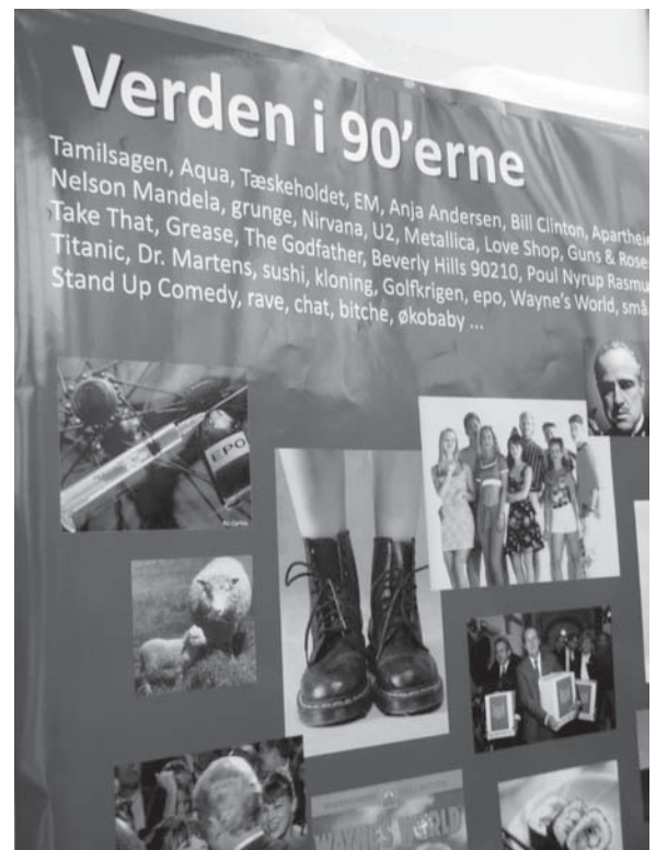
The exhibition offers the characteristics of the 90s. (The Gang of Thugs (the then popular radio programme “Tæskeholdet”) was great! The Tamil Case was not so great...)

The common denominator fills the exhibition with grandness, and you get an immediate feeling of solidarity with the RUC students of former times. Although I do not look like or feel like a left wing oriented hippie with hemp growing in my pockets and peace signs ironed onto my cheek with an iron, I sense that the feelings that were once outlived in that small room, also live on at this university and in me